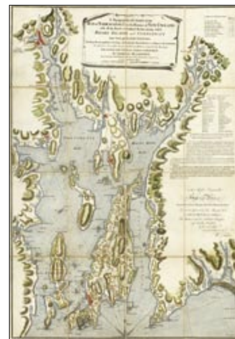
1777 Blaskowitz, Charles and Faden, William. A Topographical Chart of the Bay of Narraganset in the Province of New England, with All the Isles Contained Therein, among which Rhode Island and Connonicut have been Particularly Surveyed. London: William Faden. 93 x 64 cm. Scale 1:50,700. List no. 3951.001. Page 67